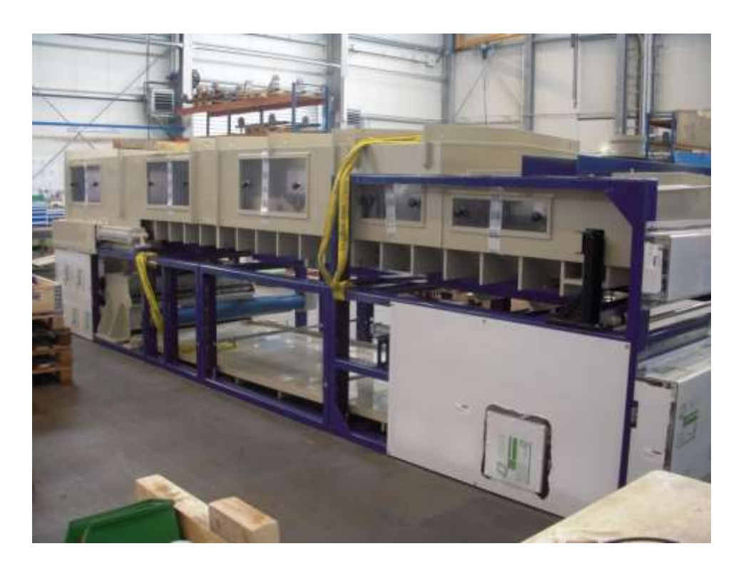
Image 2. Polypropylene belt filter with fume hood built for the filtration, washing, and drying of the sulfuric acid slurry.