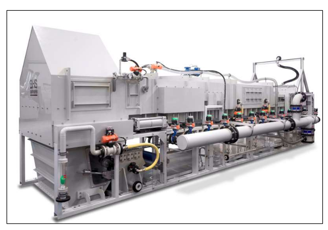
Image 1. BHS polypropylene indexing belt filter with oscillating slurry feed, fume hood and pressing/blowing device

these polymers compared to high grade alloys such as Alloy 20 and Hastelloy is much less. In fact, the use of polypropylene is even cheaper than construction using 316 stainless steel. The main limitation for using polymer constructed belt filters is temperature resistance. For a polypropylene belt filter, the maximum operating temperature is 175^{\circ}F - 194^{\circ}F ( 80^{\circ}C-90^{\circ}C ) and 212^{\circ}F - 230^{\circ}F ( 100^{\circ}C-110^{\circ}C ) for PVDF. However, for most vacuum filter applications this is not an issue as temperatures are often below the boiling point of water.