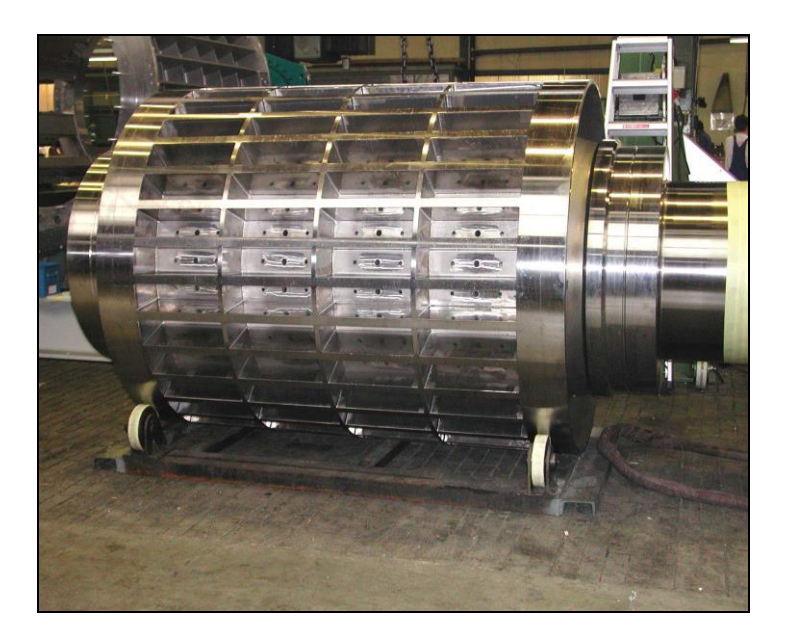
FIGURE 2: Rotary Pressure Filter Drum and Cells

BHS-Sonthofen Inc. 14300 South Lakes Drive Charlotte, North Carolina 28273-6794