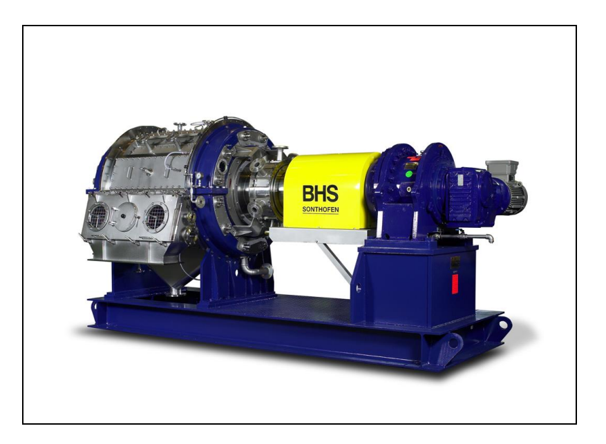
Figure 1: BHS Rotary Pressure Filter (RPF)