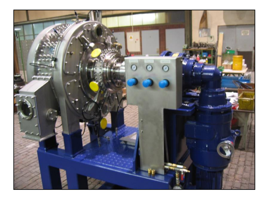
Figure 5: Rotary Pressure Filter Pilot Unit, 0.18 m2

BHS-Sonthofen Inc. 14300 South Lakes Drive Charlotte, North Carolina 28273-6794