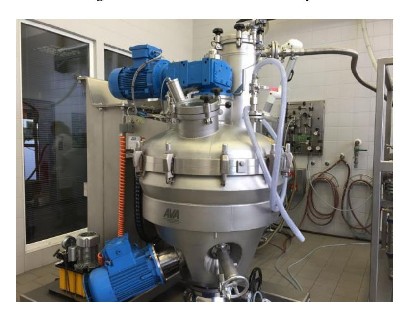
Figure 7: AVA Vertical Helix Dryer in test center

BHS-Sonthofen Inc. 14300 South Lakes Drive Charlotte, North Carolina 28273-6794