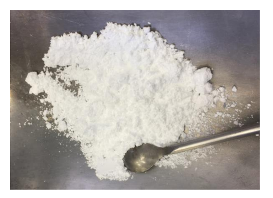
Figure 8: Final Powder from AVA Vertical Helix Dryer