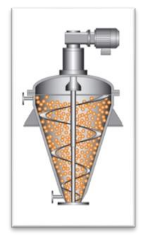
Figure 6: AVA Vertical Helix Dryer